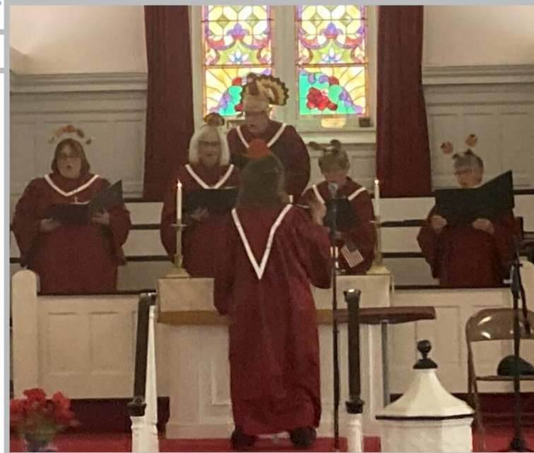
Choir for Performing Gobble Gobble for Thanksgiving!